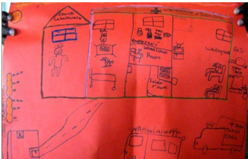
Figure 4: 'Dream Clinic'. Notable features –an ambulance and a mobile clinic, a wheel chair room, a water tank, a comfortable waiting room with access to digital entertainment