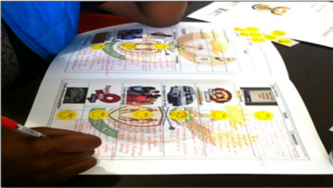
Figure 1: A teen advisor fills out a 'clinic report card', marking the provision of health services in the local clinic with a 'smiley face' or a 'thumbs down'