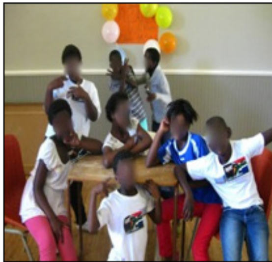
Figures 2 and 3: A cabinet of youth health advisors deliberates on the objectives of the AYHP (2014). Here, the appointed minister consults her cabinet on their experiences of health services. [Faces blurred to protect participant confidentiality]